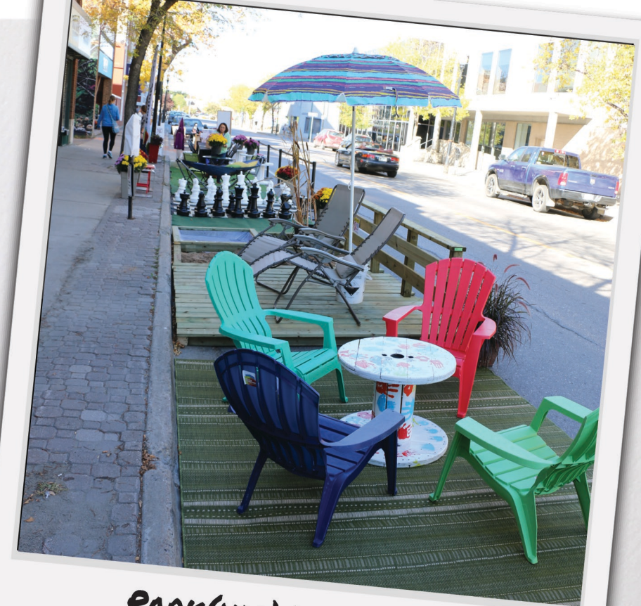
PARK(ING) DAY REGINA

WHO SHOULD ATTEND? COMMUNITY ASSOCIATIONS BUSINESS IMPROVEMENT DISTRICTS COMMERCIAL DISTRICTS AND PROPERTY OWNERS ECONOMIC DEVELOPMENT PRACTITIONERS LOCAL GOVERNMENT DESIGN PROFESSIONALS INTERESTED CITIZENS